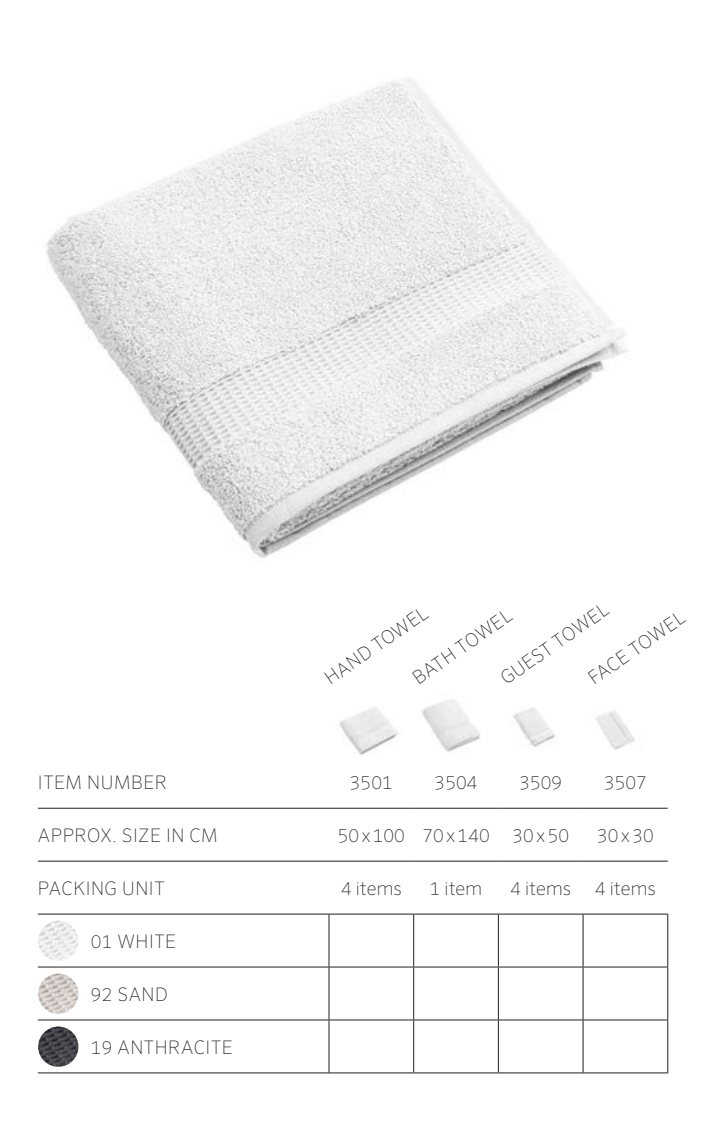
100% COTTON | 520 g/m²

Gorgeous, classic Swiss heavyweight terry cloth towel with elegant waffle trim, available in four sizes and three colours. Best weseta quality for your standard bathroom linens. venta terry cloth towels are also ideal for bigger projects and events. Sustainably manufactured in Switzerland in accordance with STANDARD 100 by OEKO-TEX®.