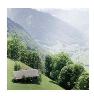
EXPERIENCE AND INNOVATION