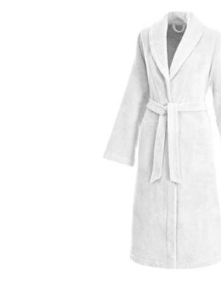
LADIES' ROBE WITH SHAWL COLLAR WITH INNER TIE