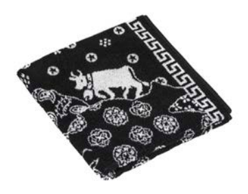
HISTORY REINTERPRETED PAGE 23