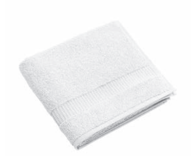
ELEGANTLY UNIQUE PAGE 22