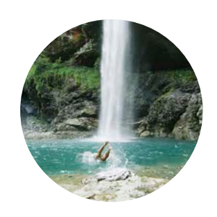
SAUNA AND MASSAGE PRODUCTS PAGE 30