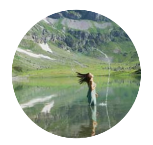
SWISS NATURAL SOAPS PAGE 28