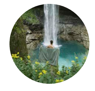
SWISS NATURAL COSMETICS PAGE 29