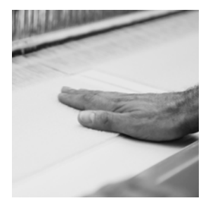
EMPLOYEES WITH FINESSE