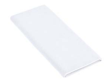
SHOWER MAT ALLROUNDER PAGE 24